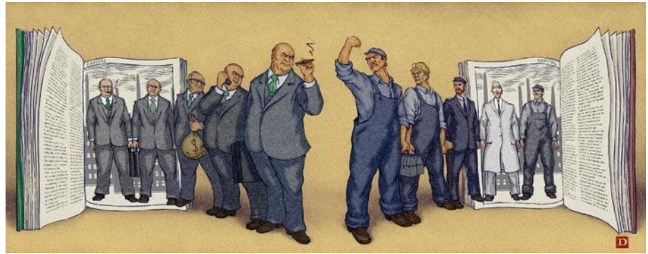
BOB DAHM FOR FP

In France and Germany, students are being forced to undergo a dangerous indoctrination. Taught that economic principles such as capitalism, free markets, and entrepreneurship are savage, unhealthy, and immoral, these children are raised on a diet of prejudice and bias. Rooting it out may determine whether Europe's economies prosper or continue to be left behind.